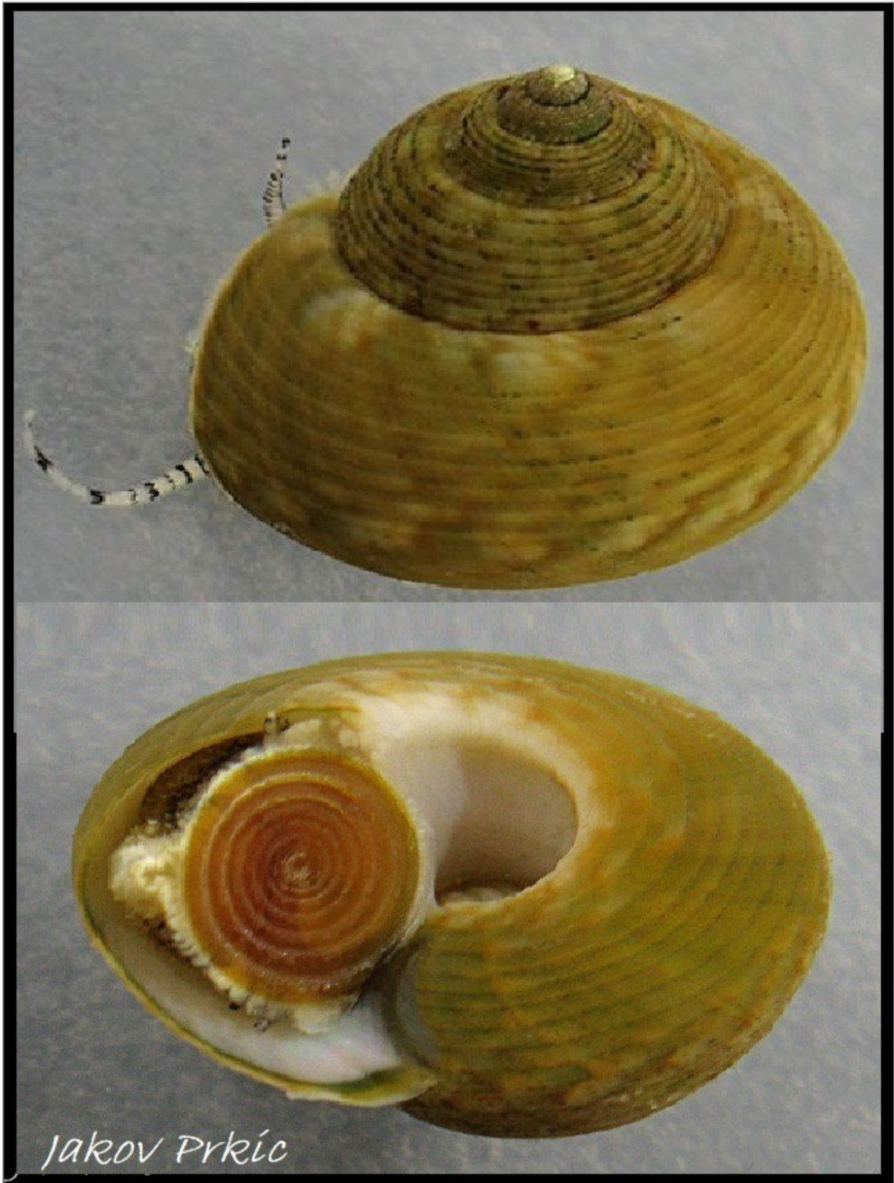
Steromphala umbilicalis (da Costa, 1778) - Trochidae