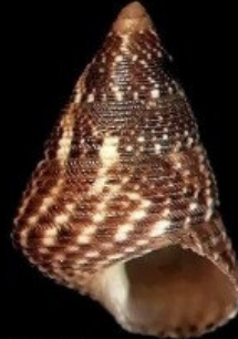
Jujubinus striatus striatus